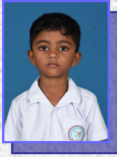
Howshithan N 2 - C - II - place